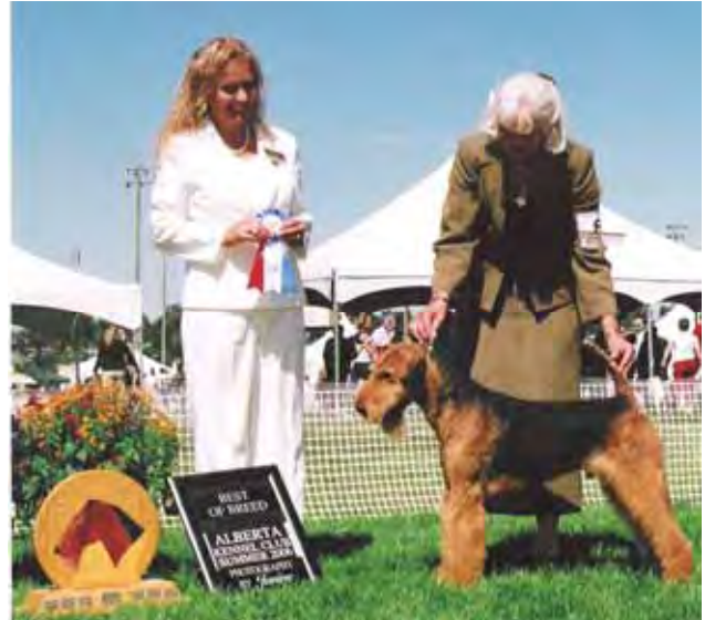
Am/Can Ch Indus Strike it Rich at Winsea