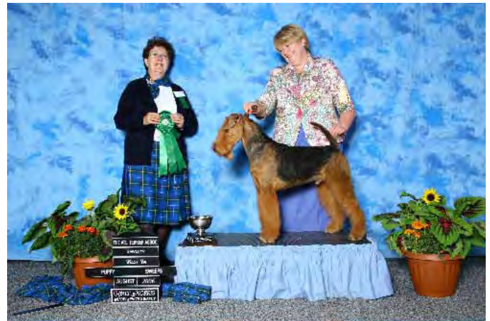
Regalridge Penaire Bronco Bill