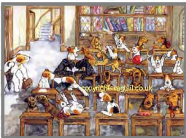
Rough Terrier School