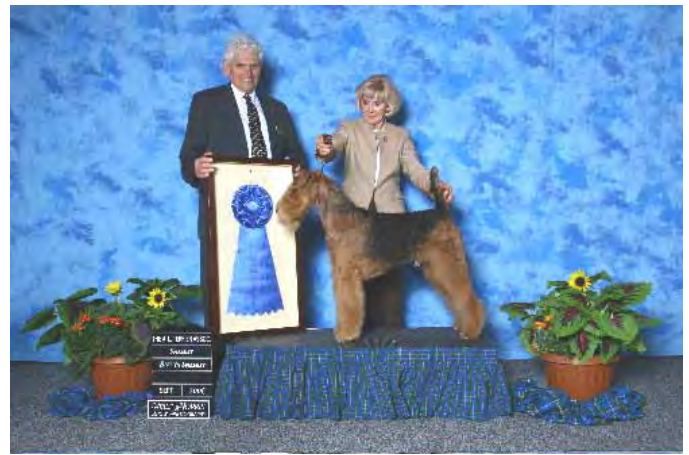
Am Can Ch Penaire's Commodore

We will all display our medallions proudly and want, once again, to thank the National Club for its' support.