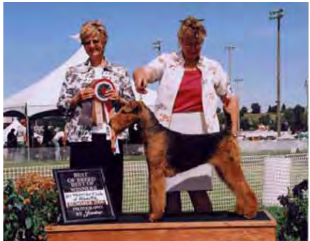
Am/Can Ch Monterra Misguided Angel